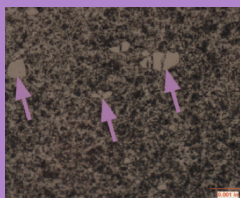
Leading sharpen-less scaler